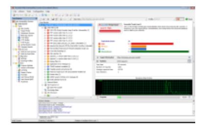
Acunetix performs automated attacks and displays vulnerabilities found.

Acunetix Web Vulnerability Scanner is able to automatically fill in web forms and authenticate against web logins. Most web vulnerability scanners are unable to do this or require complex scripting to test such pages. Not so with Acunetix: Using the macro recording tool Login Sequence Recorder, you can record a login sequence, form filling process or a specific crawling sequence. The scanner will replay this sequence during the scan process and fill in web forms and log on to password protected areas automatically.