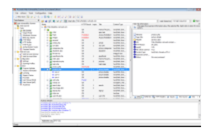
Acunetix crawls web site automatically and displays web site structure.