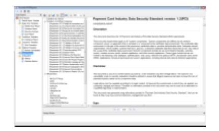
Extensive reporting including VISA PCI compliance.