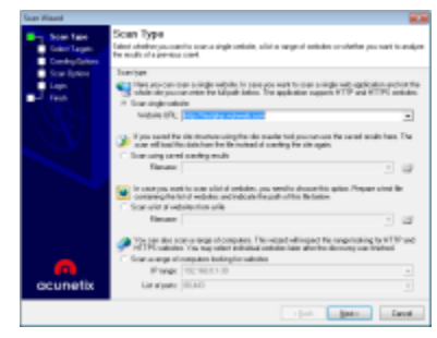
Wizard makes launching scans quick and easy.